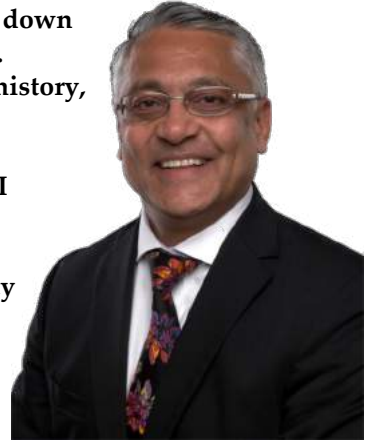
Lord Kamlesh Patel of Bradford OBE Independent Director at the ECB

As a lifelong cricket fan and a member of the ECB, I am pleased that cricket has been a catalyst to bring these communities together. I wish to pay special thanks to Ganador Sports who, through their community arm have sponsored this historic tour of the St.Peter's cricket team, to spend a week in the UK playing and engaging in a series of games and events that will aim to unite people from all faiths, cultures, ethnicities and generations through the wonderful game we all love.